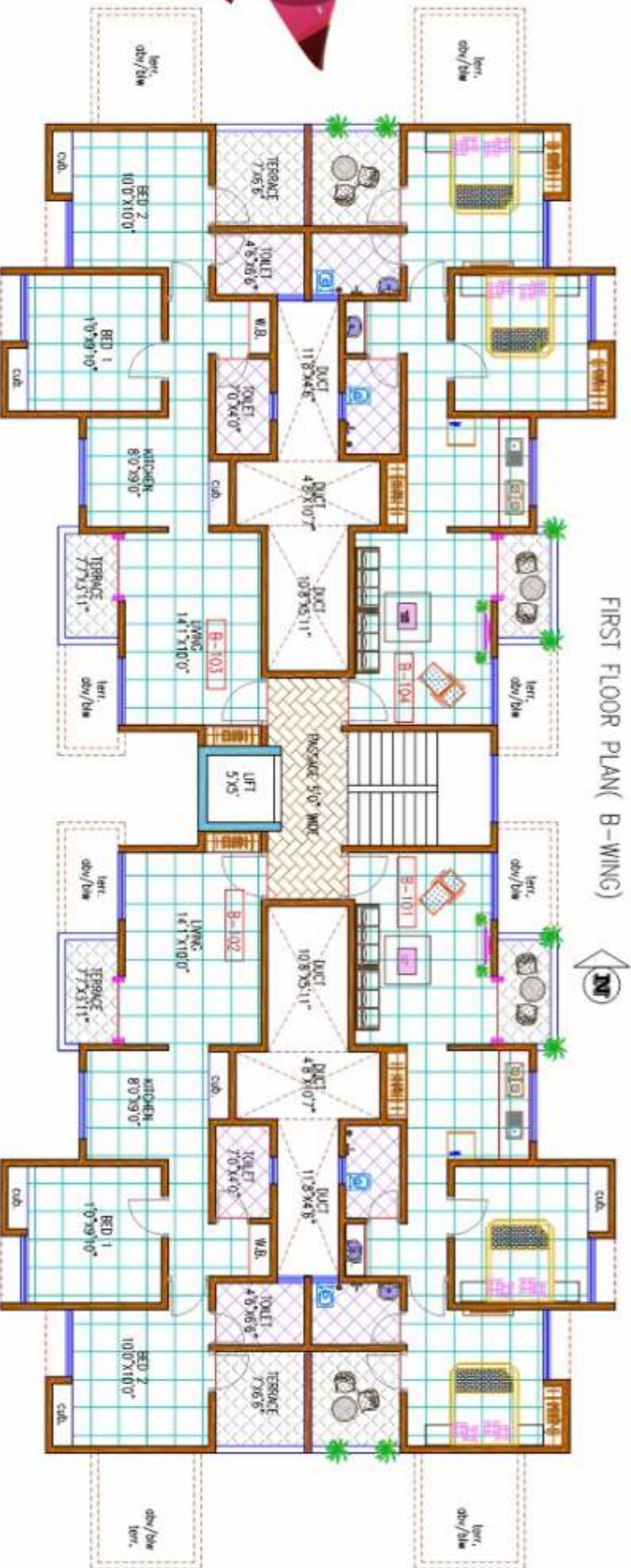
FIRST FLOOR PLAN ( B-WING)